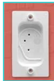
Clipsal 408/3A 3Pin Clock Point Socket

The recommended installation uses a Clipsal 408/3A 3 Pin Clock point recessed Socket to receive the Clipsal 409/3A 3 Pin plug fitted to the clock.