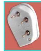
Clipsal 409/3A 3Pin Plug