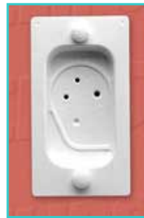
Clipsal 408/3 3Pin Clock Point Socket