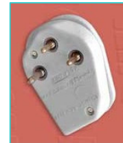
Clipsal 409/3 3Pin Plug