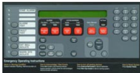
Simplex 4100U-S1 Operator Keypad